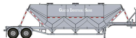
Glacier Industrial Sands 949-2626