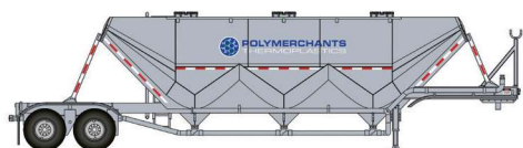
Polymerchants, Inc. 949-2622