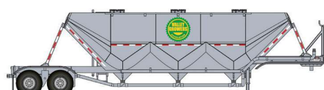
Valley Growers Association 949-2623