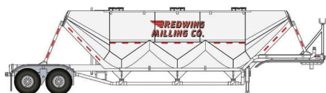
Red Wing Milling Co. 949-2624