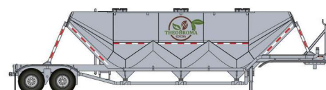
Theobroma, Ltd. 949-2625