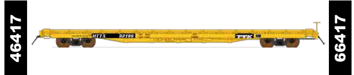
TTX Black RPNT 04-82

-67 92062 -68 92076 -69 92098 -70 92115 -71 92139 -72 92114