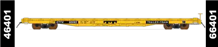
Trailer Train BUILT 11-66