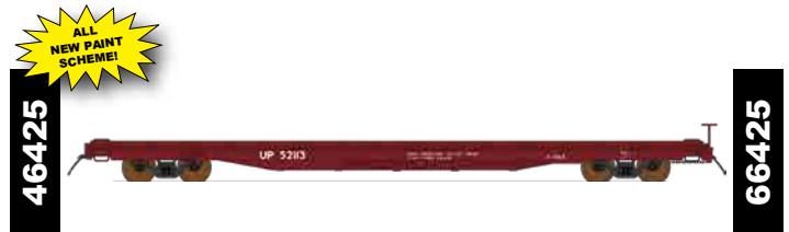
Union Pacific Brown OM 08-83

-07 93160 -08 93271 -09 93306 -10 93324 -11 93369 -12 93792