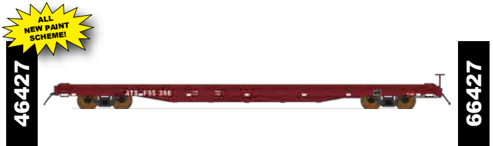
Santa Fe Late FT-44 FPNT 1990

*-01 Faded and Patched -01 576703 -02 576708 -03 576715 -04 576719 -05 576720 -06 576724