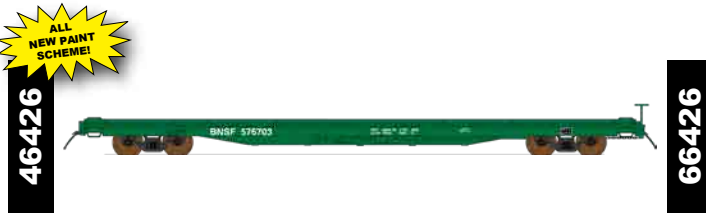
BNSF ex BN

-01 52113 -02 52129 -03 52135 -04 52144 -05 52152 -06 52160