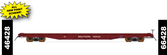
Southern Repaint RPNT 1980

-01 95398 -02 95422 -03 95437 -04 95450 -05 95472 -06 95483