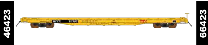
TTX Red BUILT 04-68

-07 92199 -08 92257 -09 92260 -10 92379 -11 93131 -12 93174