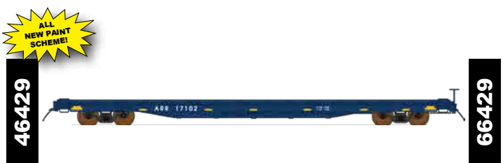
Alaska Late RPNT 2005

-01 152104 -02 152110 -03 152125 -04 152136 -05 152157 -06 152160