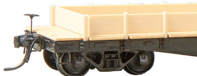
Optional double board sides (included)