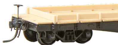
Optional single board sides (included)